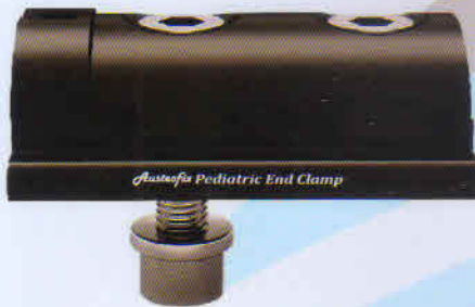
Cat. AFPEC PEDIATRIC END CLAMP