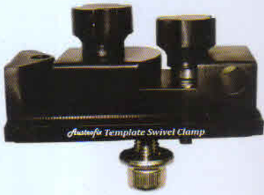
Cat. AFTSC TEMPLATE SWIVEL CLAMP