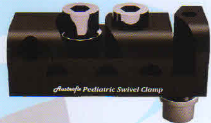
Cat. AFPC PEDIATRIC SWIVEL CLAMP