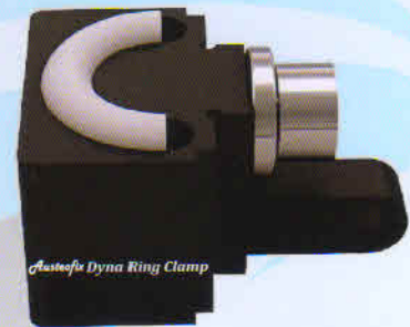
Cat. AFDRC DYNA RING CLAMP