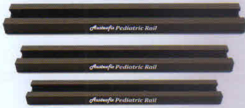
Cat. AFPR PEDIATRIC RAIL 150MM, 200MM, 250MM