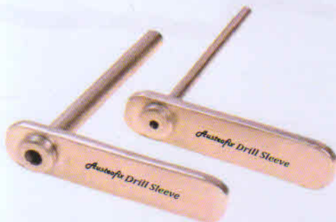
Cat. DRILL SLEEVE Size : 2.7 & 4.5 MM