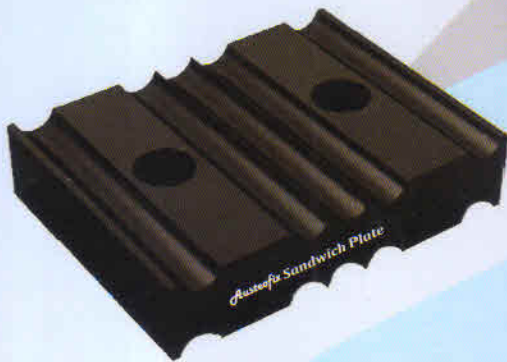
Cat. AFSP SANDWICH PLATE