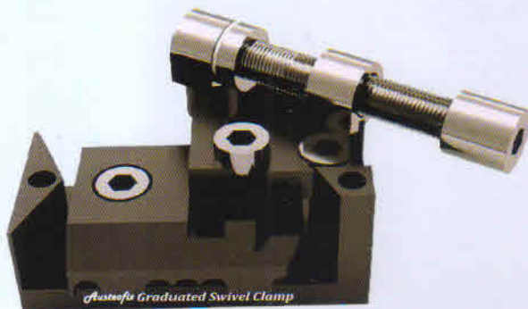
Cat. AFGSC GRADUATED SWIVEL CLAMP