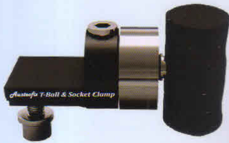
Cat. AFTBS T - BALL & SOCKET CLAMP