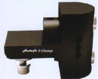
Cat. AFTC T- CLAMP