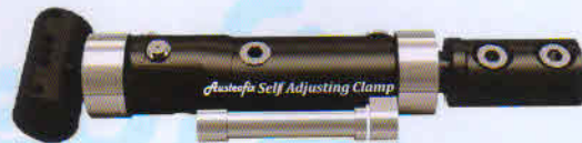
Cat. AFSAC SELF ADJUSTING CLAMP