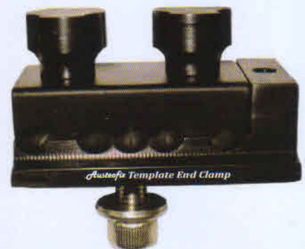
Cat. AFTEC TEMPLATE END CLAMP