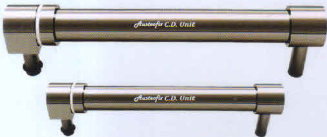
Cat. AFCD C. D. UNIT Size : 40mm, 80mm