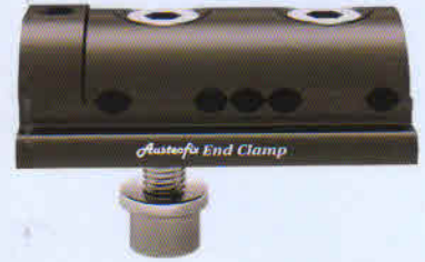
Cat. AFEC END CLAMP