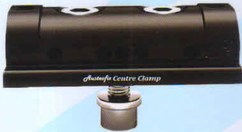
Cat. AFCC CENTRE CLAMP