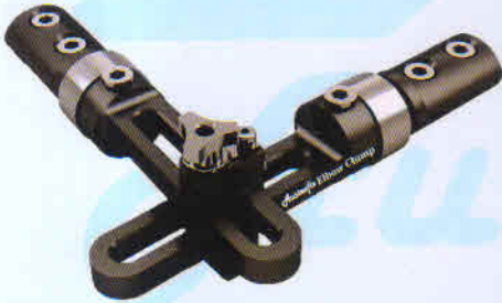
Cat. AFEC ELBOW CLAMP