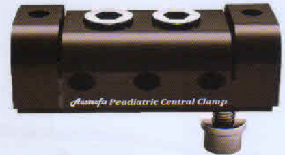
Cat. AFPC PEADIATRIC CENTRAL CLAMP