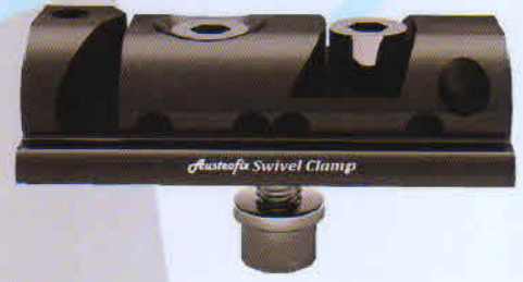
Cat. AFSC SWIVEL CLAMP