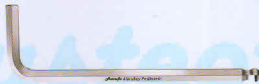
Cat. AFAK ALLENKEY Size : 6 MM ADULT