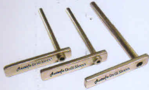
Cat. AFDS DRILL SLEEVES Size : 3.2mm, 4.5mm, 6.0mm