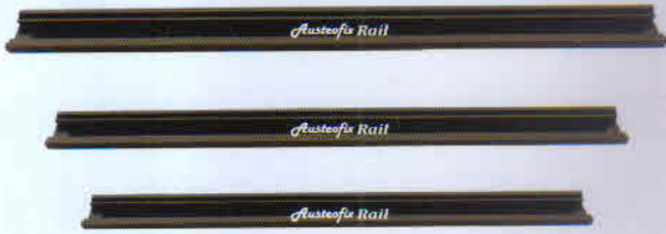
Cat. AFR RAIL Size: 240mm, 300mm, 400 mm