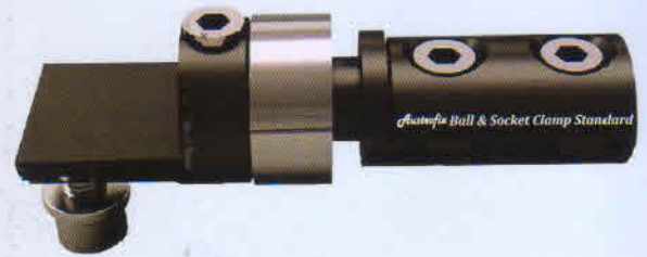
Cat. AFBSC BALL & SOCKET CLAMP STANDARD