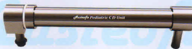
Cat. AFPCDU PEDIATRIC C D UNIT